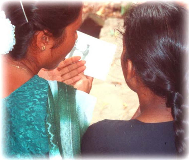
Lessons and Picture Books